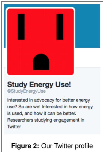
Figure 2: Our Twitter profile

Nichols et al. [5] treats Twitter users as a “crowd”, by inverting the direction of the question. Their work asks Twitter users to share information about TSA wait-lines at airports, and aggregates participant responses into a shared resource. Here, we explore the social component of engagement, and ask Twitter users a question around a common interest to facilitate a ‘social crowd’. We mirror the structure that Nichols et al. introduce, and extend it in one key way: by seeking to understand the social component of engagement when inverting the request direction. We show users that they are a part of a larger process and show them the social nature of many people participating in parallel. Our study explores how facilitating a social crowd on Twitter can increase participation and engagement around a common topic.